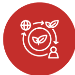
Environmental Protection & Sustainability