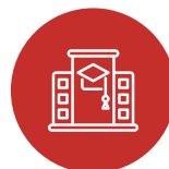
Academia & Research Institutions