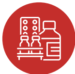
Pharmaceuticals & Healthcare