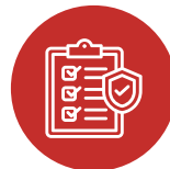
Safety & Compliance