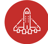
Aerospace & Defence