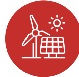
Energy, Power & Utilities