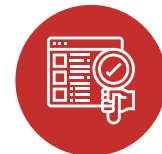
Testing, Quality Assurance & Control