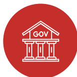
Government & Regulatory Bodies