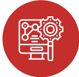
Engineering & Research Development

We provide access to over a million standards and technical documents to individuals and organizations from diverse functional areas, research fields and various industries. Our primary patrons are from the following disciplines and rely on us to get the right information at the right time.